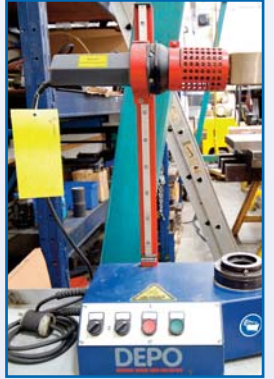
DEPO DST 10 TOOL SEALING MACHINE