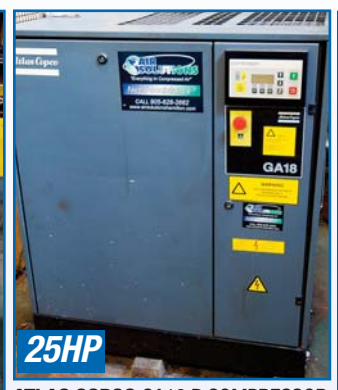
ATLAS COPCO GA18 P COMPRESSOR