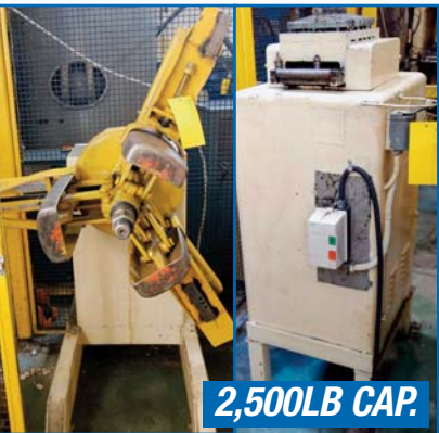
UNCOILER & FEEDER/STRAIGHTENER