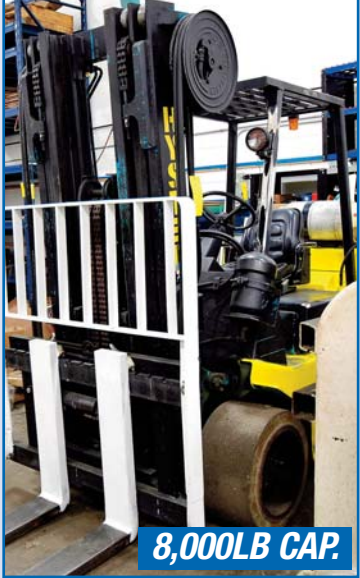
HYSTER S120XLS PROPANE FORKLIFT