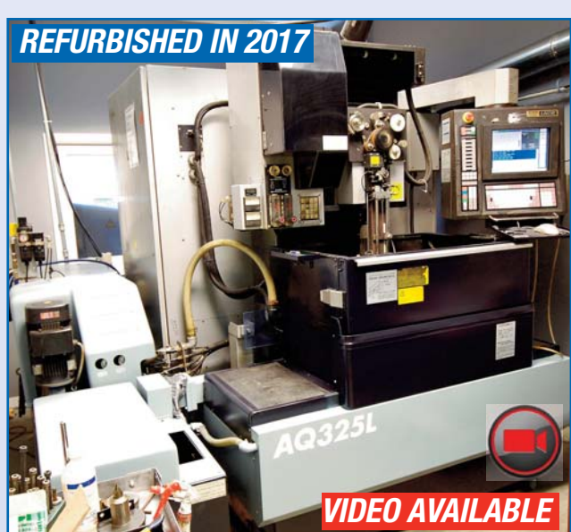
SODICK AQ325L WIRE TYPE EDM