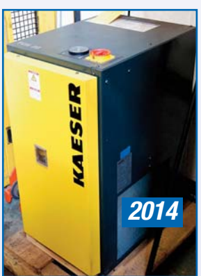
KAESER TCH-32 AIR DRYER