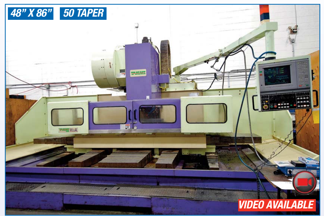
TAKUMI SEIKI V22A CNC VERTICAL MACHINING CENTER