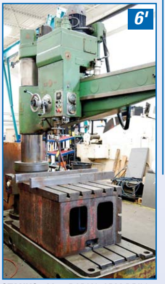
STANKO 2M55 RADIAL ARM DRILL