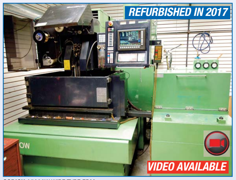
SODICK A5000W WIRE TYPE EDM